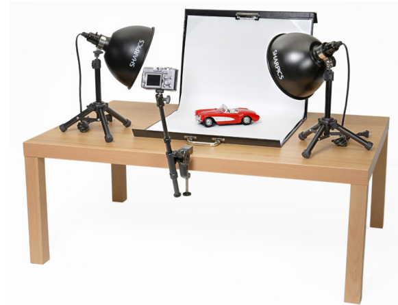
CTS-200/CTS-300 (CTS-200 shown)