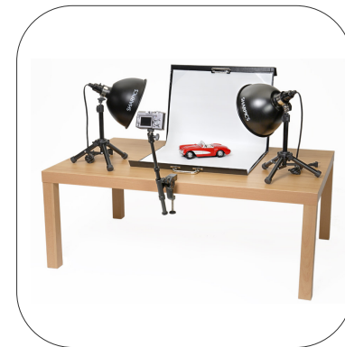
Complete Tabletop Studio