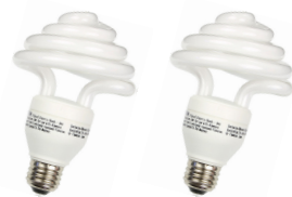
Daylight bulbs included