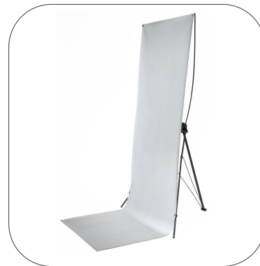
PolyBounce™ Reflective Background with Stand