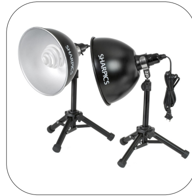
Tabletop Studio Lighting