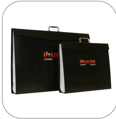
D-Flector™ Portable Photo Studio Backgrounds